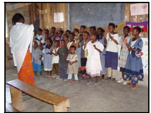
Waso- Teacher and children singing a welcome