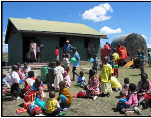
Party at Aytong School