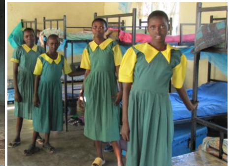
Boarders with their new beds

Since 2004, FKSU donors have given funds for 62 primary school scholarships, 20 boarding scholarships and 2 secondary school scholarships at Kokwa Primary, windows, doors, curtains, bednets and bunkbeds for the girls' dormitory, the 4K Club school garden project, a solar pump for the garden and renovation of a school toilet.