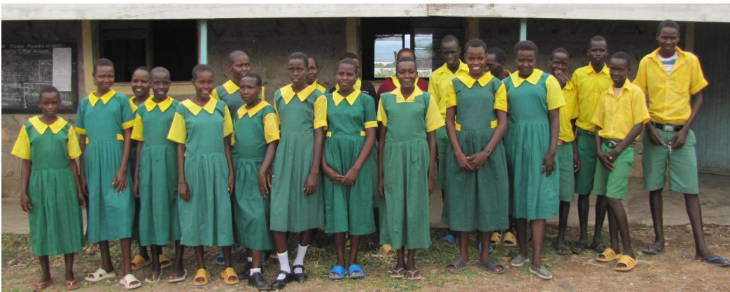
Some of the scholarship recipients at Kokwa Primary School

*The 4K Club is similar to 4H in the U.S. The Ks stand for "Kuungana Kufanya Kusaidia Kenya" (Coming together to Work to Help Kenya)