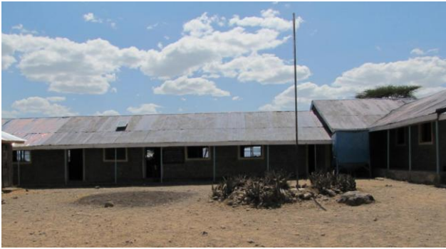
Kokwa Primary School