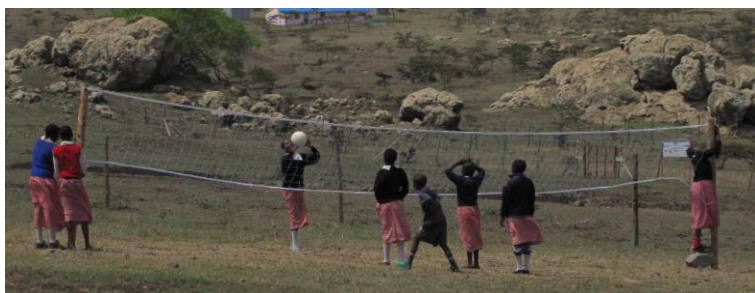
Students enjoy the new netball court

Endonyio Sidai community members are working together to realize their dream: a primary school for their children. Constructing one classroom a year since 2006 with assistance from FKSWS and the Kenya Ministry of Education, the parents are thrilled that students in grades 1-4 are able to attend school just a short walk from home. Previously, they hiked down a 1,000 foot escarpment to the nearest school each morning and back up each afternoon. A classroom for fifth graders, under construction now, should be completed by January. Community members also built a toilet and just installed a fence around the compound with funds from FKSWS.