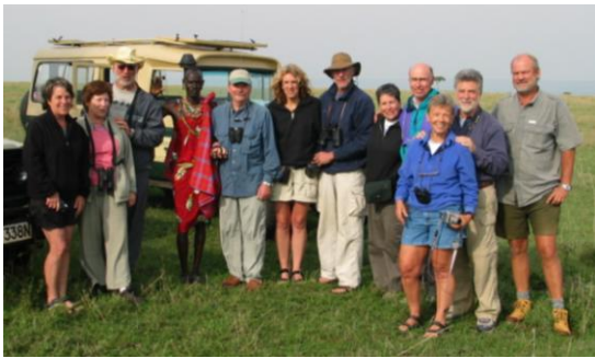
The first FKSWSafari, January 2004