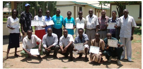
Community Health Workers at the end of training.

In September, a man and a woman from each of the five villages on the island attended a week long Community Health Worker training which gave them skills to link the villages and the health system, educate community members on healthy living, disease prevention and how to seek medical attention, and to map community health needs. The curriculum included: communication skills, working with people of different ages, first aid, malaria, sexually transmitted diseases (STD's) and HIV/Aids, TB, water and sanitation and field work, including mapping of households to capture demographic information about each family on the island. For most of the trainees, this was the first time they had ever attended a class of any kind. At the end of training each trainee was issued a certificate.