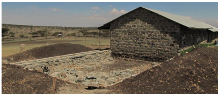
A fifth classroom takes shape at Endonyio Sidai Primary School