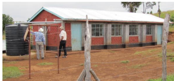
Tuinuane Nursery School with new water catchment system and a new fence.

Since 2008, FKSWS donors have given funds for two nursery school classrooms, desks and benches, and a water catchment system at Tuinuane.