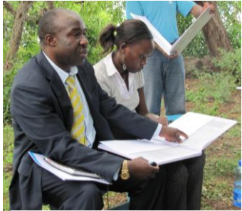
A doctor from the Ministry of Health explains to CHWs how to use their registers.