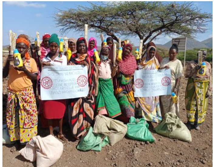
Kachiuru women with thank you signs for Eugene Metropolitan Rotary Club's support during December and January