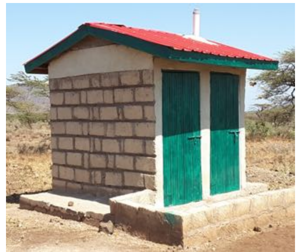
Teachers' toilet at Kachiuru