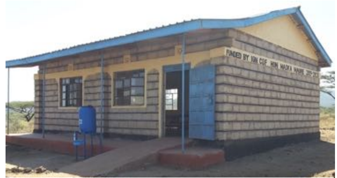
Classroom at Kachiuru Primary School built by the CDF