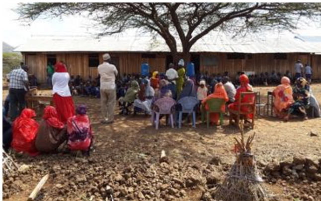
Meeting at Kachiuru informing residents about the CBO