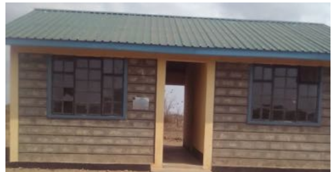
Above, new administration office and staff room at Kachiuru

Last year, in addition to the scholarships, Land and Life constructed a building to house a staff room and an administration office at Kachiuru Primary. They also constructed a toilet for the teachers.