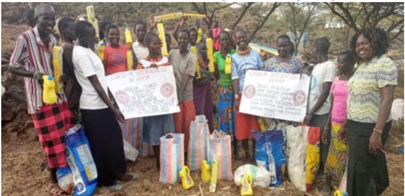
Kirepari women and gentlemen