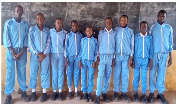
Kirepari Junior secondary students in new track suits