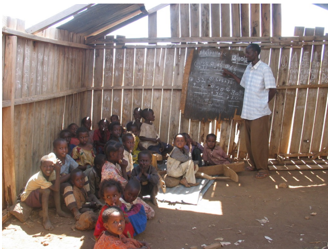
2004 Sitting on dirt and stones in the only classroom at Kachiuru