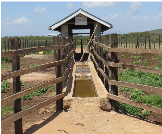
Kachiuru cattle dip

This Press Release from her office following the event confirms her promise, during our meeting, to collaborate with FKSWS and NECOFA to benefit the Kachiuru community, especially in providing much needed water, sanitation, and hygiene services. We are excited about this collaboration and the direct relationship it will create between the community and the county in the future!