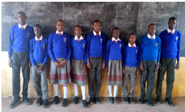
Junior secondary students at Kirepari

Forty-seven of the 101 students FKSW supports this year have sponsors who help with their education costs.