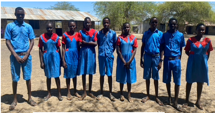
Boarders at Kiserian Primary School

Forty-seven of the 101 students FKSW supports this year have sponsors who help with their education costs.