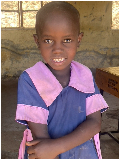
A Kirepari Primary School student