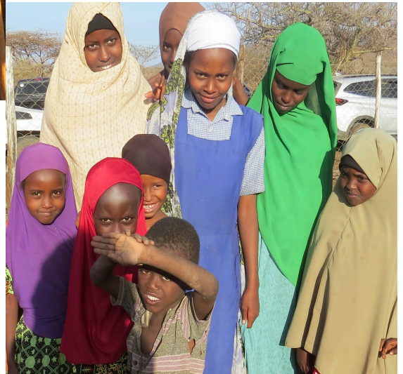
Women and children

Siku ya furaha katika Kachiuu! A happy day at Kachiuu!