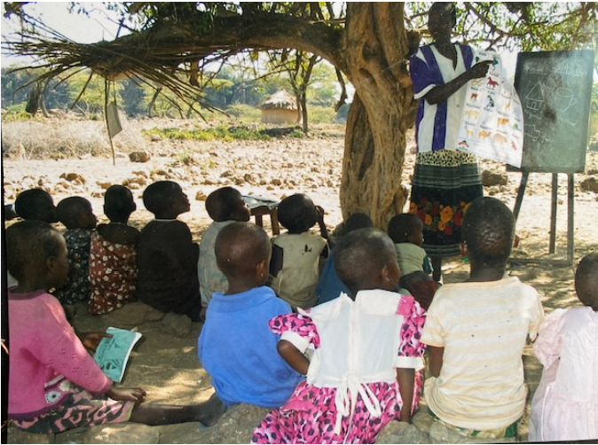
2004 Lessons under a tree at Longicharo, Lake Baringo, sitting on stones