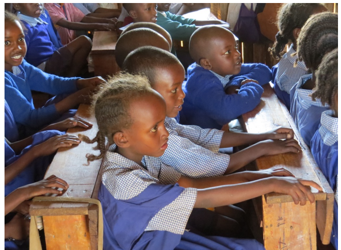
2023 Students in one of 8 classrooms at Kachiuru Primary School