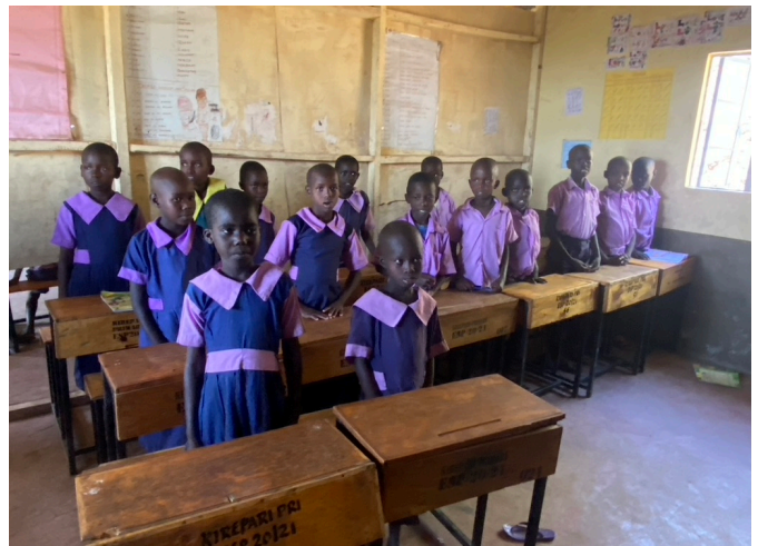
2023 Students in one of 8 classrooms at Kirepari Primary School