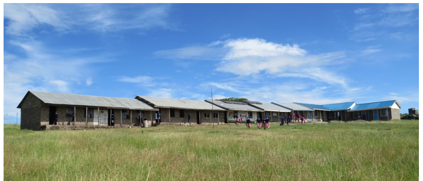
2023 Endonyio Sidai Primary School - 8 classrooms, Head Teacher's Office and Staff Room