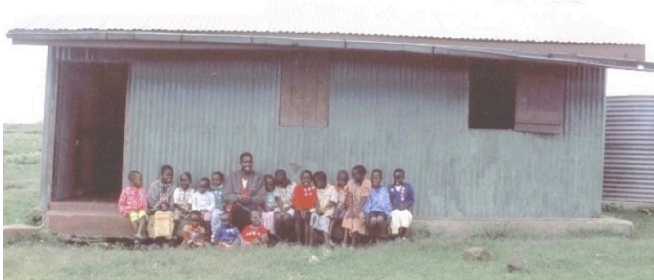
2004 The community church served as the school on weekdays at Endonyio Sidai