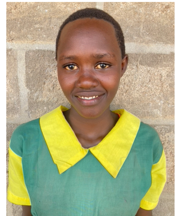
Chebet- Kokwa Boarding

For 1 year, that's: $50 - primary day $75- junior secondary $125- boarding- room, board, tuition $500- secondary- room, board, tuition $500 Special schools $500- $1000 Post secondary