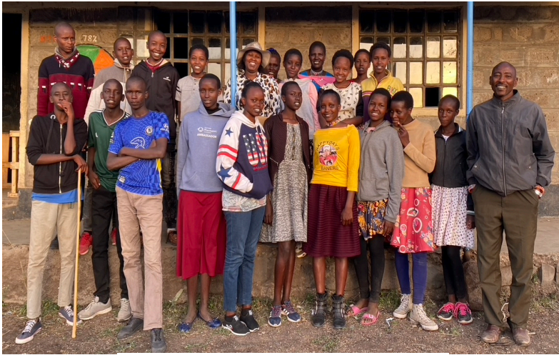
Secondary students at Endonyio Sidai