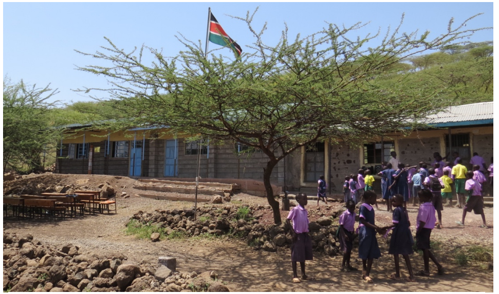
Kirepari Primary School