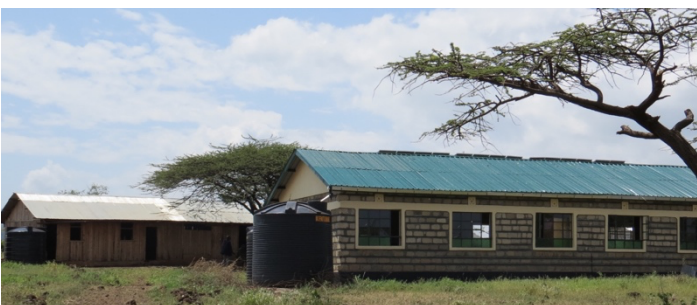
Kachiuru Primary School