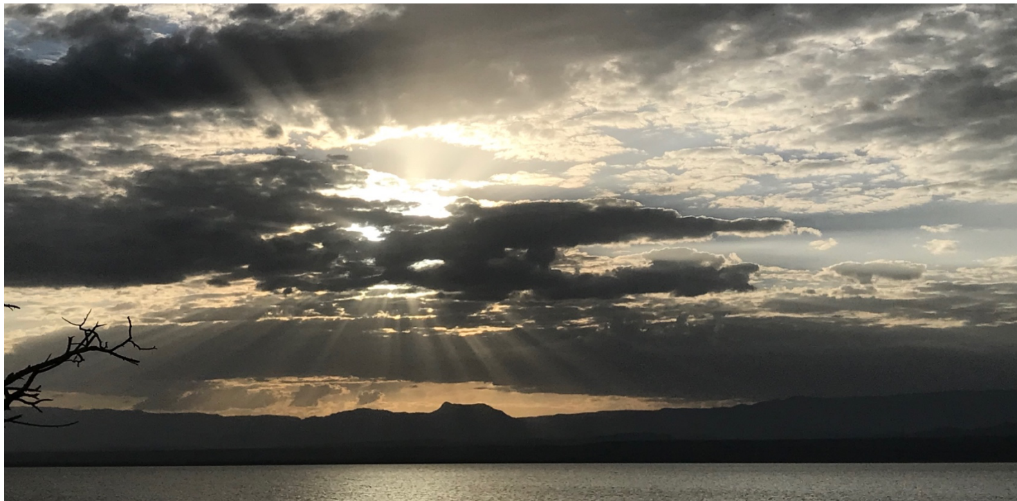
Sunset at Lake Baringo

Hayo ni yote kwa sasa! That's all for now!