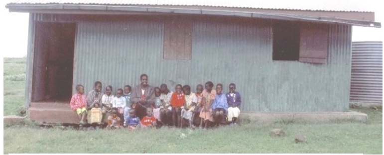
Nursery school class in the church at Endonyio Narok in 2004

Our first visit was south of Nairobi at Endonyio Narok, (now called Endonyio Sidai.) This Maasai community sits on the edge of the Great Rift Valley's Nguruman Escarpment which rises 4,000 feet from the valley floor. During a meeting with residents, we learned that their primary school-aged children walked down the escarpment daily to a school on the valley floor and then hiked back up in the afternoon, often crossing paths with cape buffalo or other wild animals. The hike was time-consuming and unsafe and the community's priority was the construction of a primary school nearer their homes. We promised those with whom we met that we would keep their request in mind. Before we left, we gave them wall charts, educational materials, and toys for the nursery school class that was housed in the community's church.